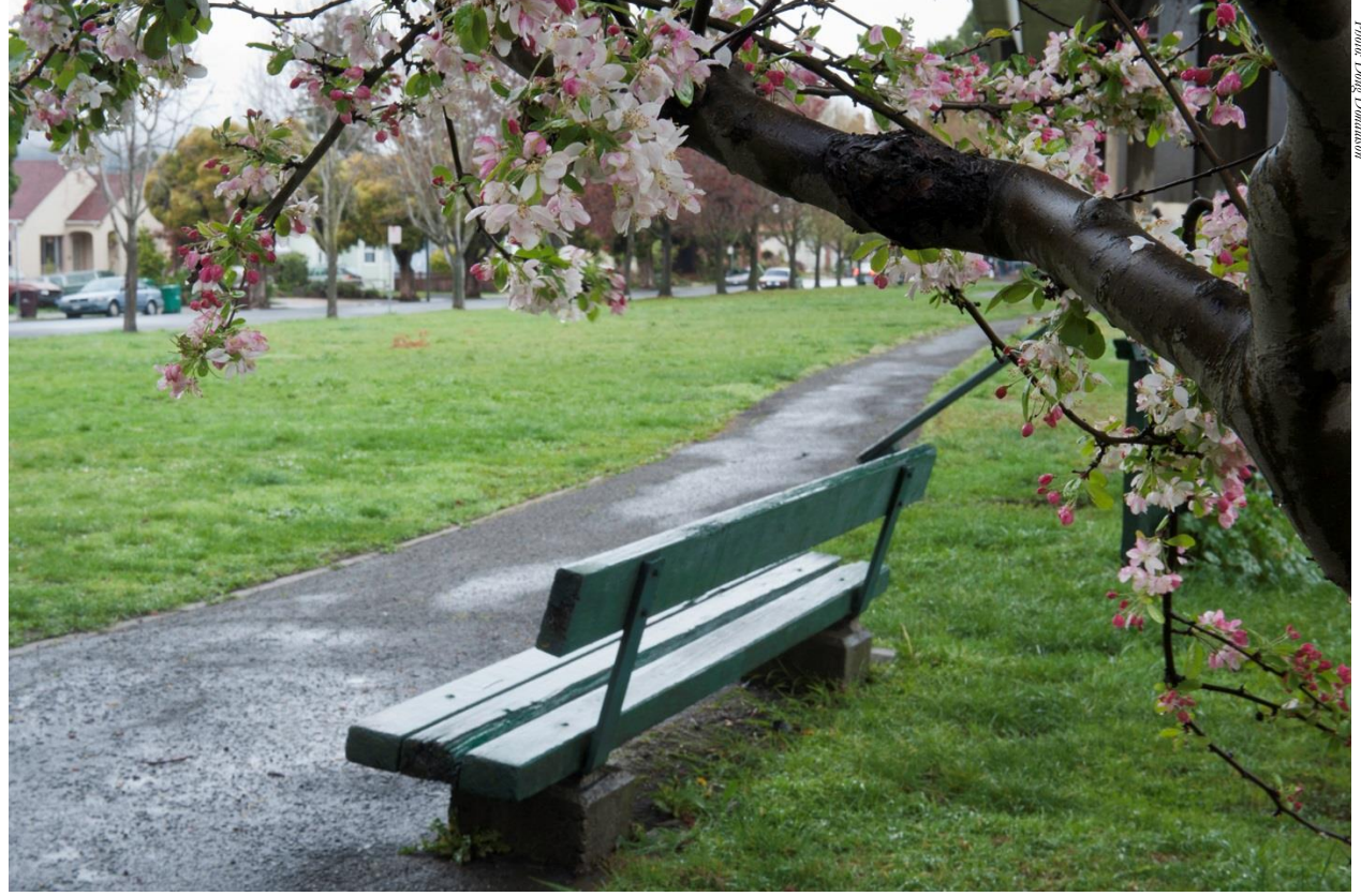
Ohlone Greenway near Codornices Creek

Per capita acreage standards are supplemented by distance standards (in other words, the distance a resident has to walk, bike, or drive to reach a park) and standards for specific types of facilities. The National Recreation and Park Association (NRPA) has a guideline that all residents should be within ½ mile of a neighborhood (or community) park. Some parts of Albany do not meet this standard, including the high-density areas along Pierce Street and the east side of Albany Hill. Construction of the new Pierce Street Park should address this deficiency.