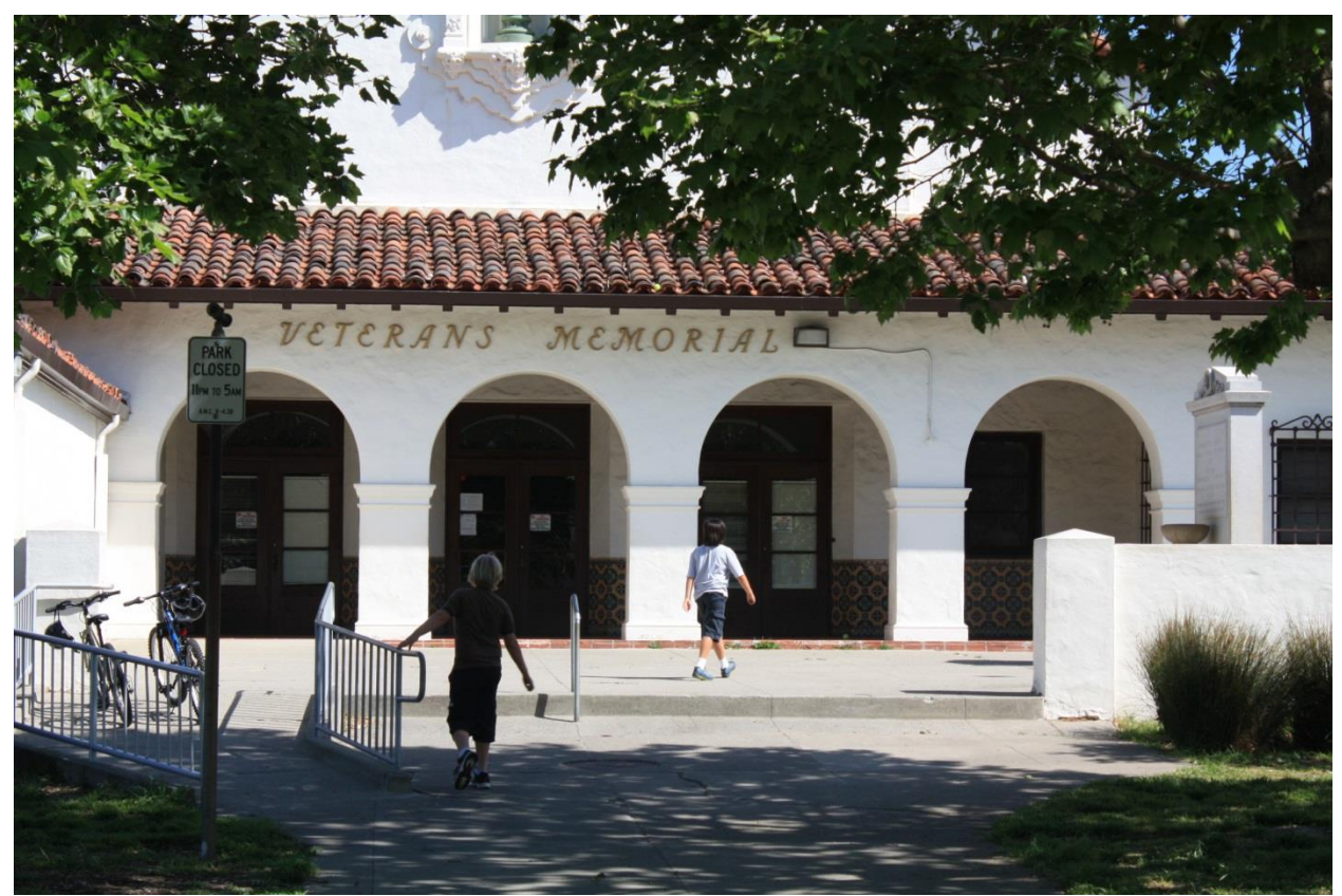
Veterans Memorial Building, Memorial Park