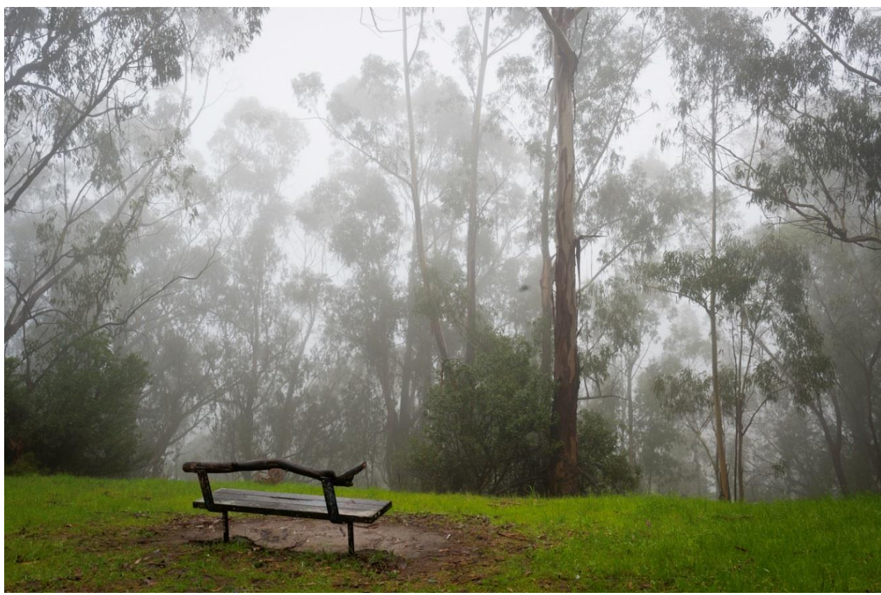
Albany Hill Park

At the same time, Albany is planning for the improvement of its traditional local park system. This system includes community and neighborhood parks, natural resource areas such as Albany Hill, and linear features such as the Ohlone Greenway. Continued investment in public parks is necessary to keep pace with the demand for recreational services and open space as population and employment grow.