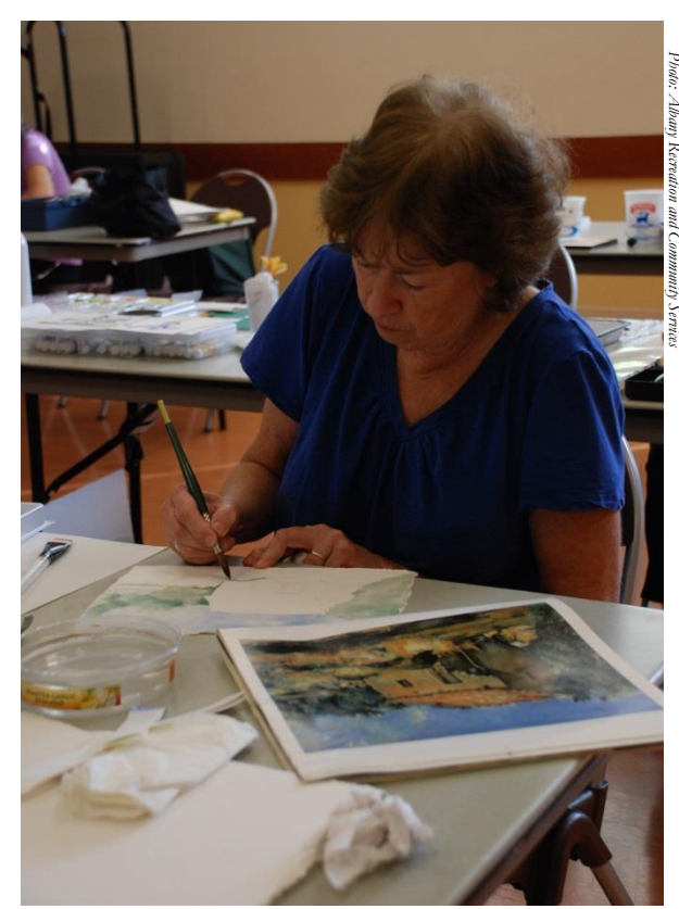
Recreation and Community Services Drawing Class

In general, maintenance and rehabilitation needs have increased due to aging equipment and higher facility usage. The City relies on the General Fund to cover most of these costs. Larger expenses, including major park renovations and new facilities, may be funded through the Capital Facilities Fund or through bond measures.