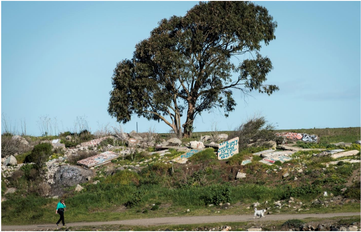
Waterfront Spur Trail to the Albany Bulb