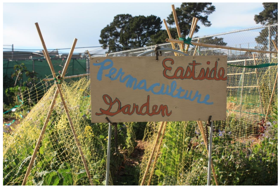
Eastside Permaculture Garden in Memorial Park

In addition to the open spaces described above, most residential properties in Albany include front yards, back yards, and side yards. Collectively, these spaces create a sense of spaciousness, provide access to sunlight, and support habitat for birds and other wildlife. Landscaped roadway medians, rights-of-way, and areas around public buildings also are part of the open space network. Streets themselves provide another form of open space and present opportunities for greening, stormwater management, community gatherings, and certain forms of active and passive recreation. Open spaces also may include rooftop gardens, urban plazas, schoolyards, courtyards, and other outdoor activity areas.