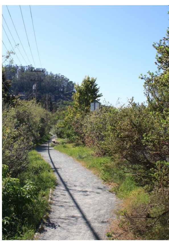
Cerrito Creek Trail

Other planned improvements include the extension of trails along Cerrito and Codornices Creeks. Opportunities for such trails exist west of San Pablo Avenue, where much of the land on the Albany side of the creek is already in public The planned senior housing ownership. development at University Village will include trail improvements along Codornices Creek, linking San Pablo Avenue to the existing trail further west. There is also a potential to improve the trail system along Cerrito Creek within Creekside Park, and to the east near El Cerrito Plaza. Opportunities for creekside trails are much more limited elsewhere along these creeks, since they are located in private backyards.