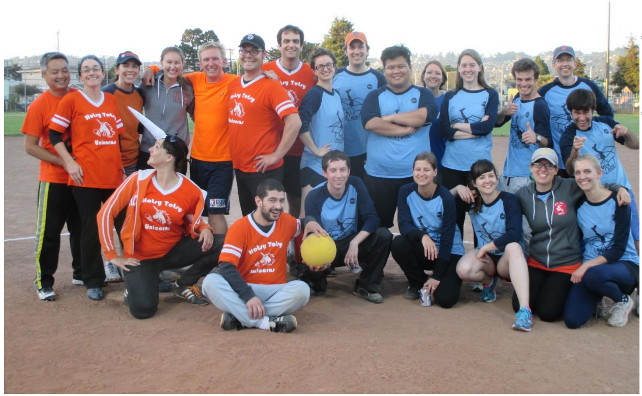
Albany's Hotsy Totsy Unicorns Kickball Team