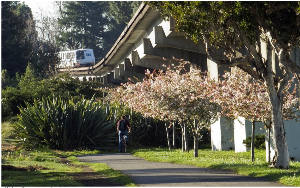
Ohlone Greenway path