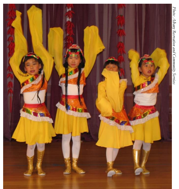
Chinese New Year tumbling performance

Renovate and maintain City sports fields and continue to collaborate with areawide sports field users on field programming and maintenance. Explore opportunities to create new sports fields, including fields on locations outside of Albany, through joint powers agreements, and joint efforts with field users. In addition, to increase the usefulness of athletic fields, encourage field designs and configurations that can accommodate multiple sports rather than one sport alone.