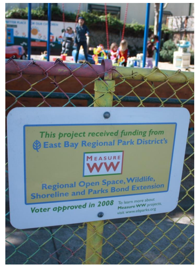
Dartmouth Mini Park

Work with Caltrans, Union Pacific Railroad, and other parties to explore enhancement of the underutilized open space along Interstate 80, particularly on the east side of the freeway at the Buchanan Street interchange. Use of this space for landscaping, gateway signage, public art, stormwater management, and similar improvements should be considered.