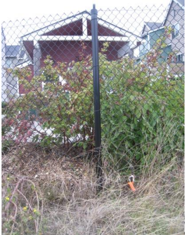
UC VILLAGE HOUSING